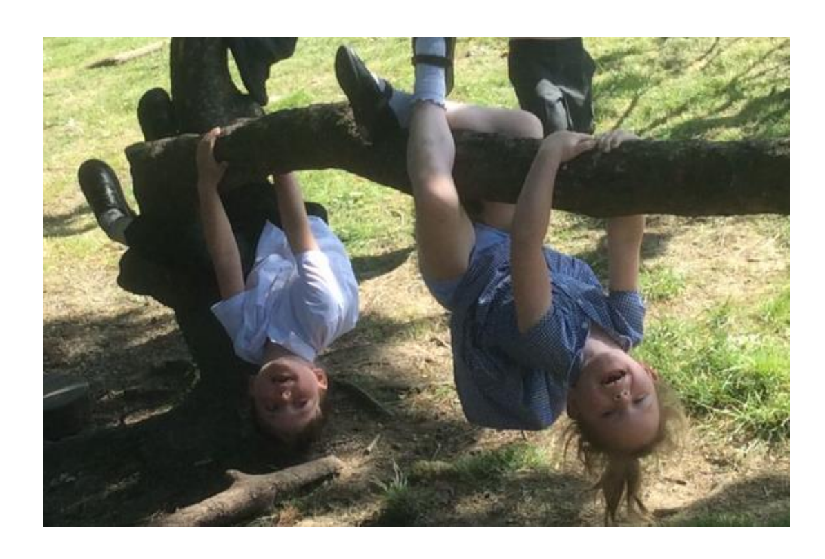
Where Every Child Matters