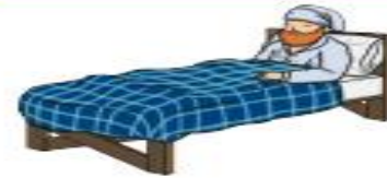
all soldiers had a bed