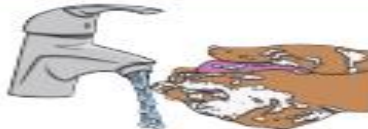
nurses washed their hands regularly