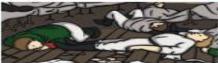
some soldiers had to sleep on the floor