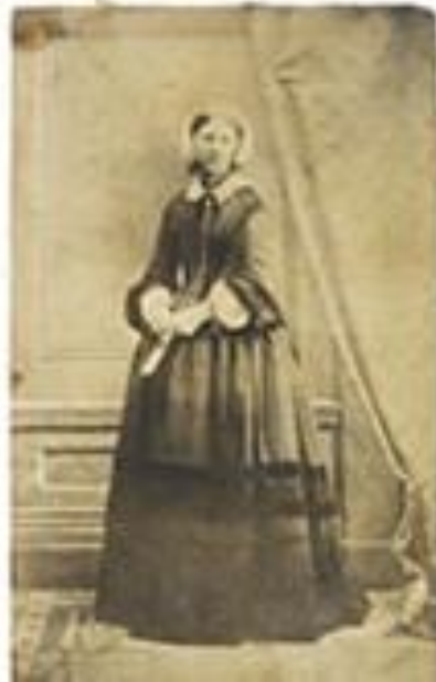
Florence Nightingale A Famous nurse Born 1820. Died 1910.