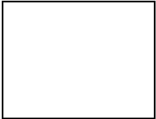
Lightening rod method