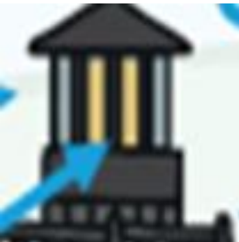
Lantern room and lamp