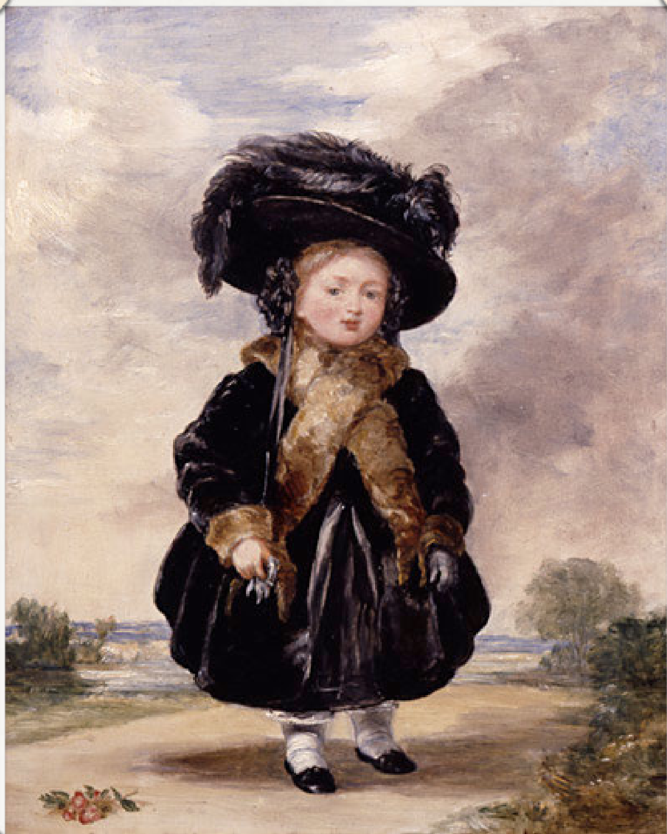
Princess Victoria, aged 4

Victoria was born in Kensington Palace in London on 24th May 1819. She was the daughter of Edward, Duke of Kent and Victoria of Saxe-Coburg. Her father was the son of King George III and brother to King George IV and William IV. At first, no one thought Victoria would ever be queen but her father's older siblings had no surviving children and she became next in line to the throne. Victoria's father died when she was still a baby and her mother gave her a strict and lonely upbringing. She rarely had friends to play with and spent a lot of time on her own drawing, painting or playing with her toys. The young princess had no brothers or sisters.