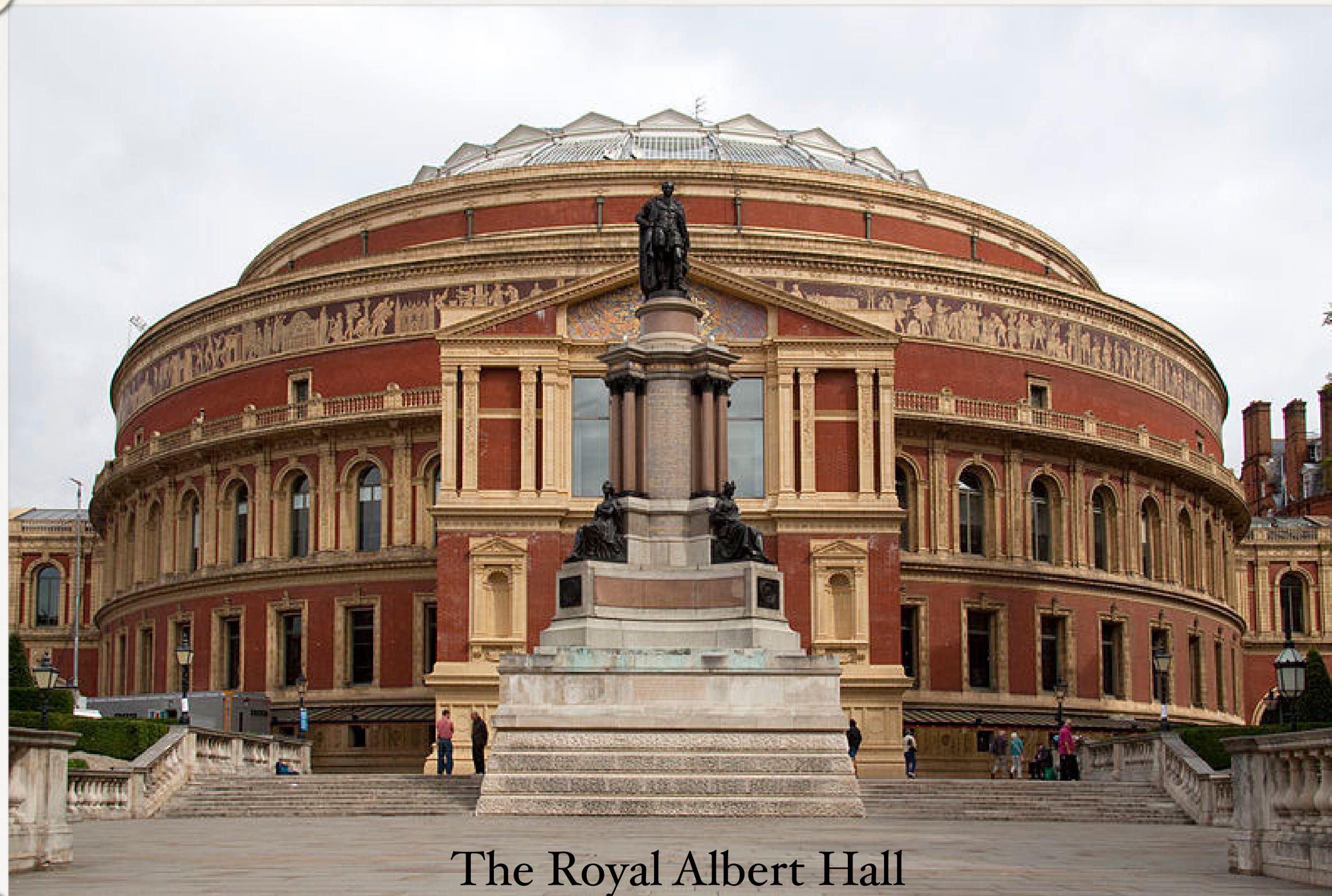
The Royal Albert Hall

Eventually, Queen Victoria's grief over the death of her husband lessened and she was able to fulfil her duties as queen again. She created several memorials to her husband, such as the Royal Albert Hall and the Victoria and Albert museum.