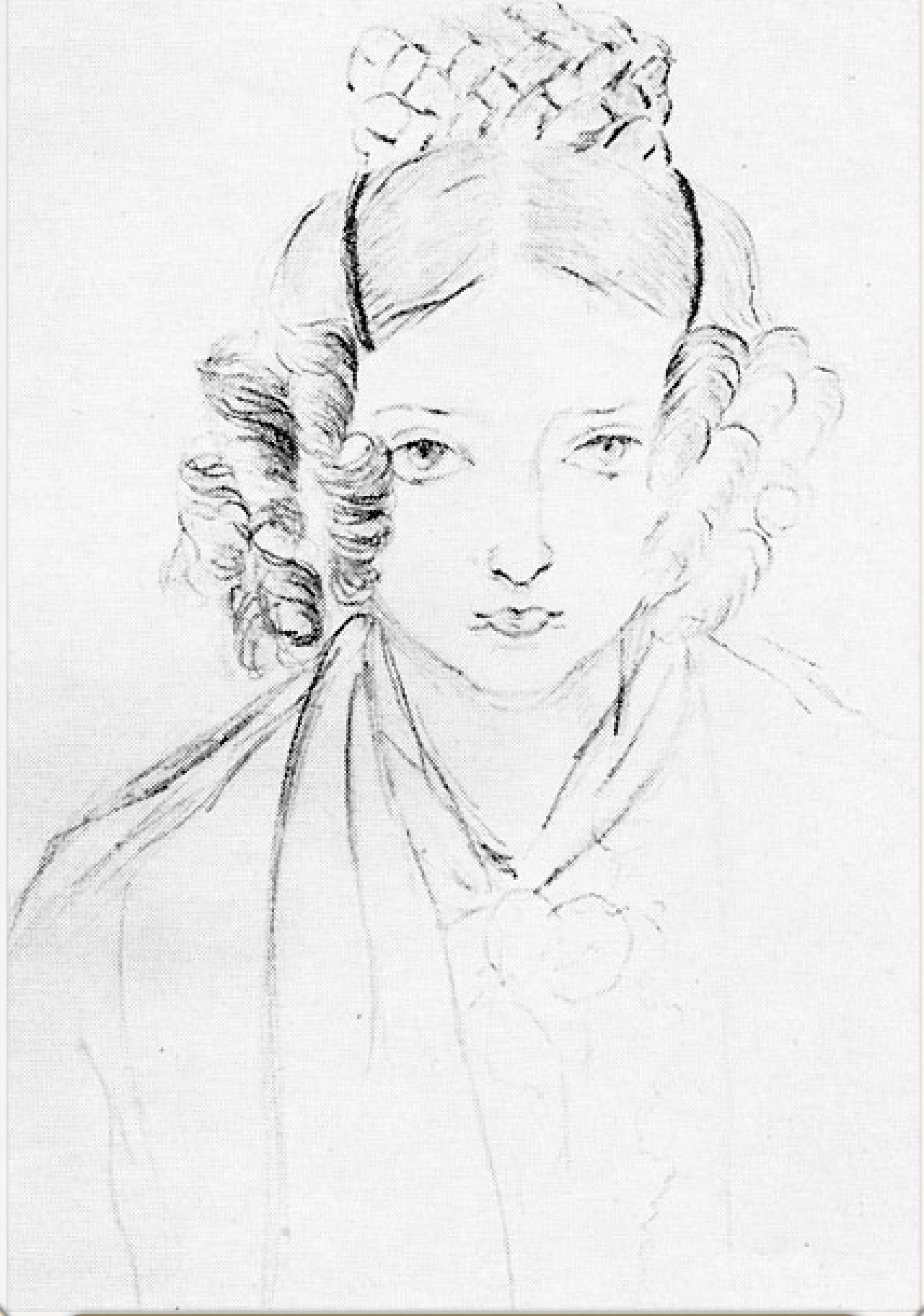
A self-portrait of Princess Victoria, 1835

As Princess Victoria got older, it became clear that she would one day be queen. Her mother prepared her for this by giving her a good education and making sure that she was aware of what her role as queen would entail. She could speak several different languages and was also a talented artist. At the age of 13, her mother took her on a journey around England to see how ordinary people lived. This helped her to understand what England was really like. It was at this time when Victoria first started writing a journal, a habit she continued every day until her death.