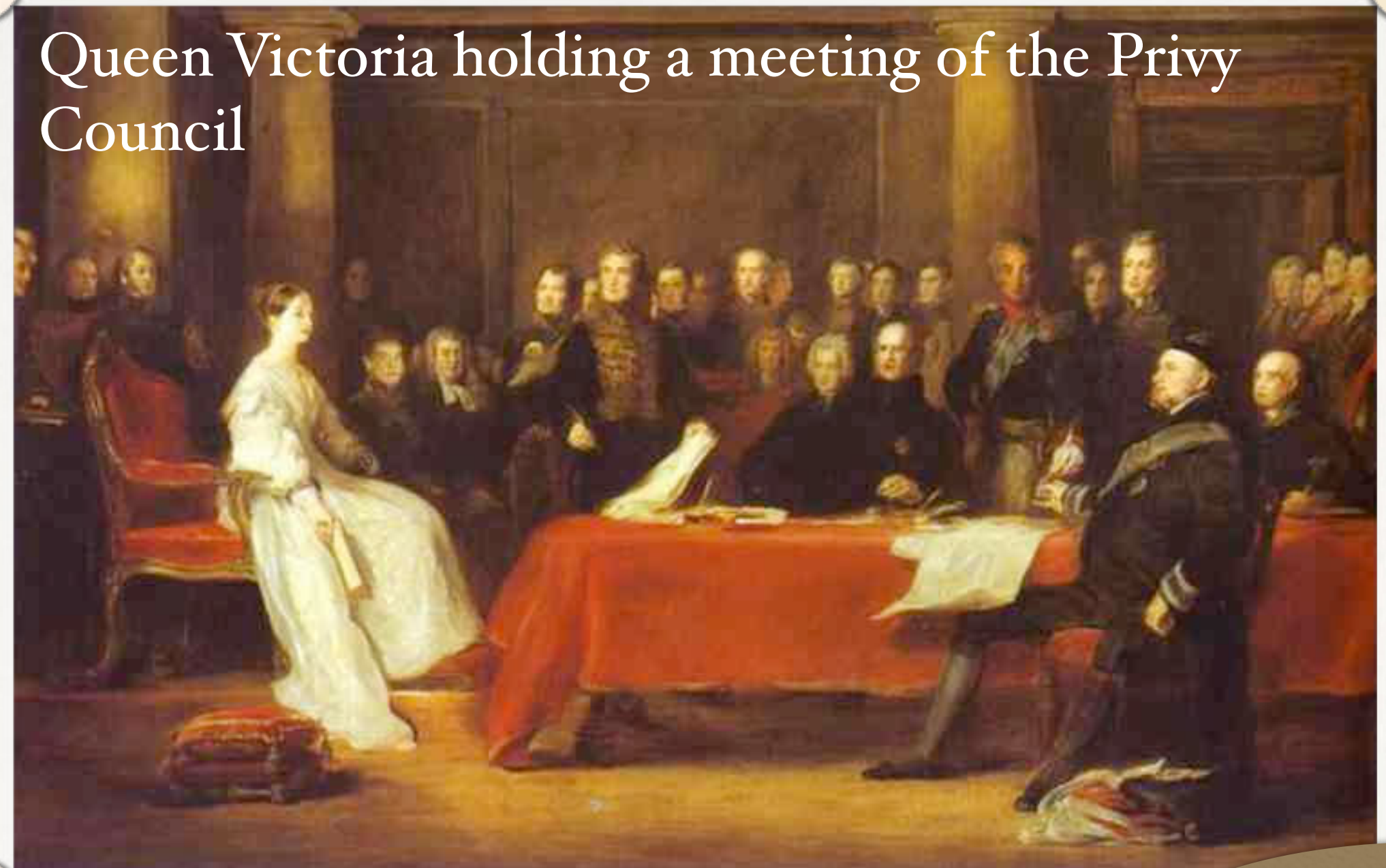
Queen Victoria holding a meeting of the Privy Council

Queen Victoria took her duties very seriously and made a promise at the start of her reign that she would always do her best for her country.