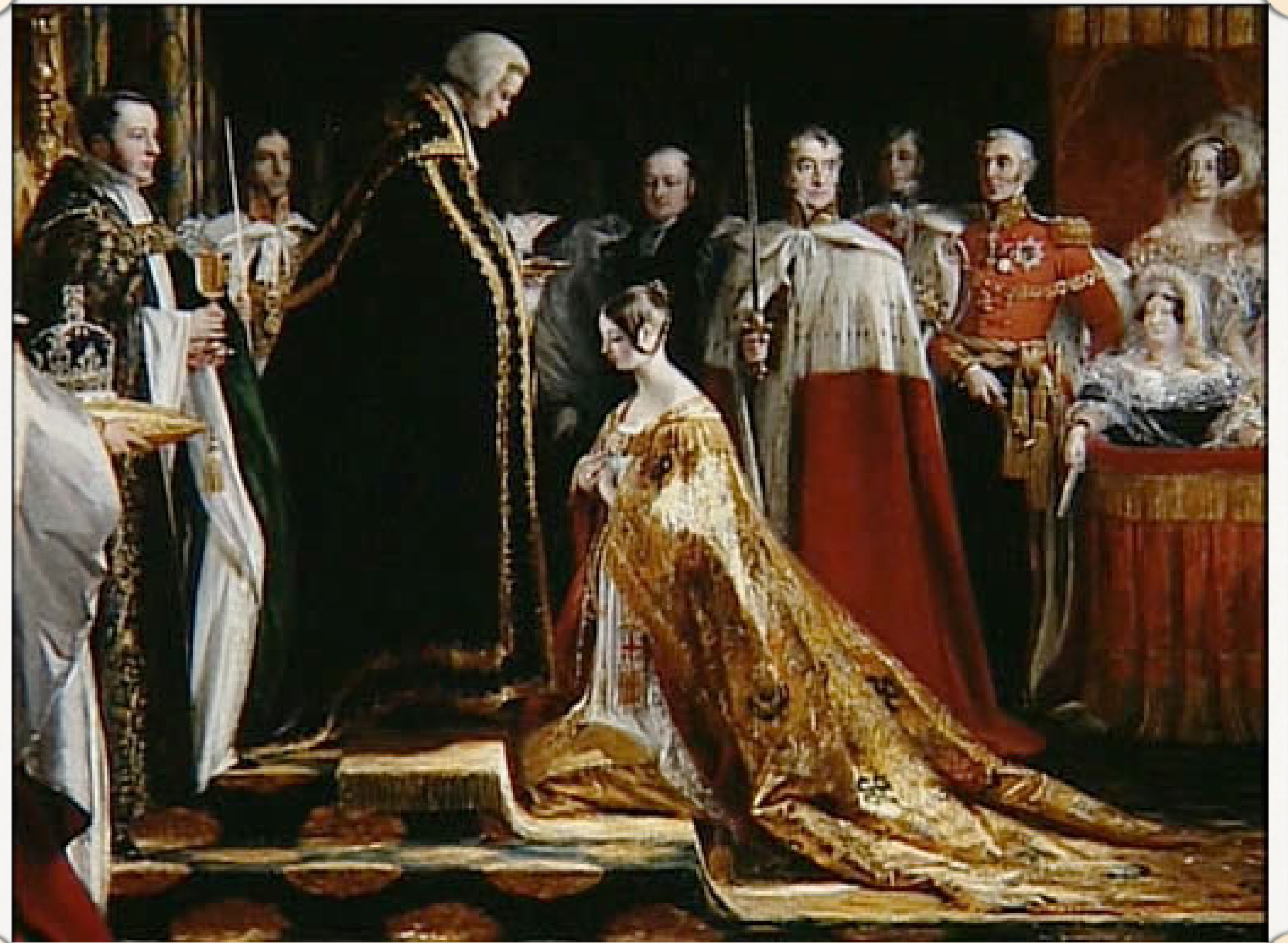
The coronation of Queen Victoria

When Victoria first became queen some people thought she would be too young to rule effectively and that other powerful people would be able to influence her. However, Queen Victoria had a strong sense of what was right and what was wrong and could be stubborn when she needed to be. Most people in Britain were delighted that someone young and energetic was coming to the throne as the old kings that had come before her had been very unpopular.